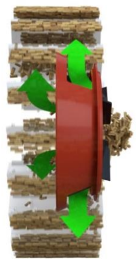
Even material distribution over the complete knife ring width